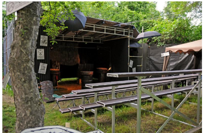
PICTURE B simple bleachers