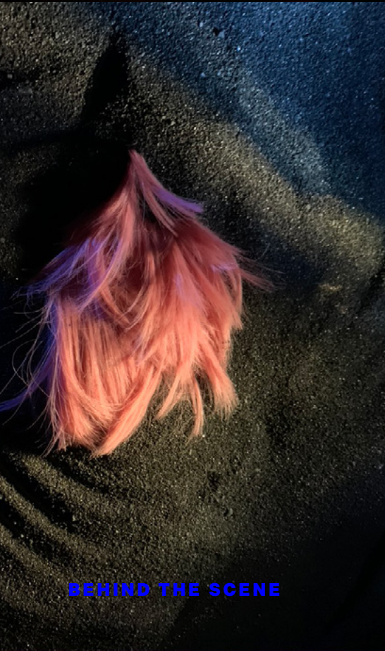
BEHIND THE SCENE