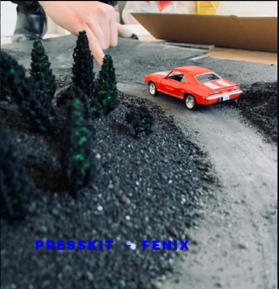
PRESSKIT - FENIX